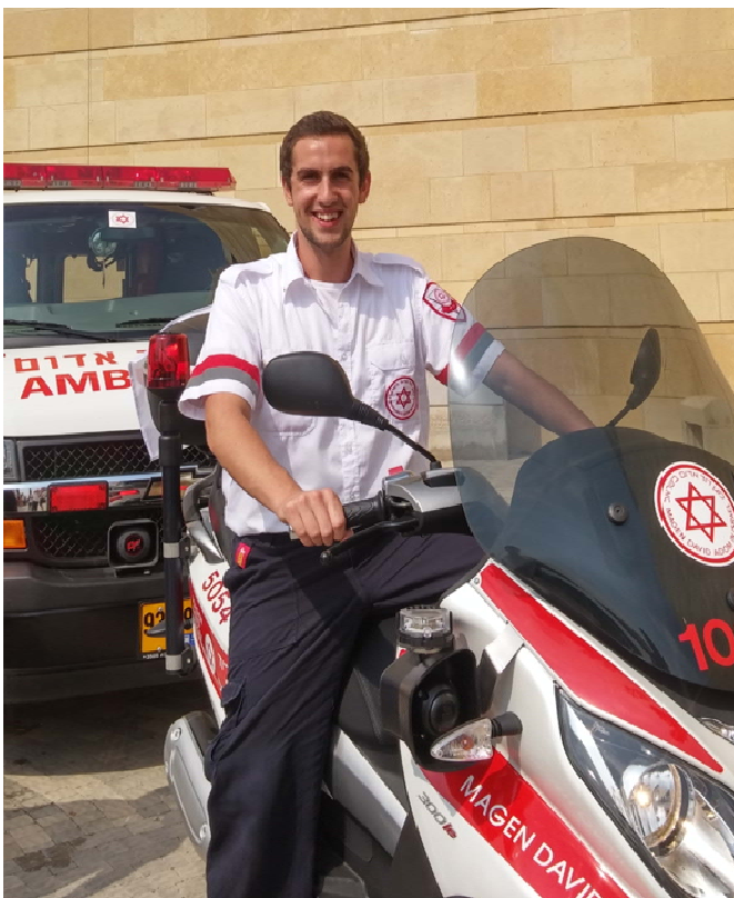
Magen David Adom

In this and coming years I will be a very active madrich of Bnei Akiva New Zealand; planning and running peulot for chanichim and being a hardworking and enthusiastic madrich at our bi-annual camps. I will support community events, such as the Jewish community picnic where Bnei Akiva Wellington plan to run a stall and sports games. I also plan to help out the Jewish community in whichever other ways I am needed.